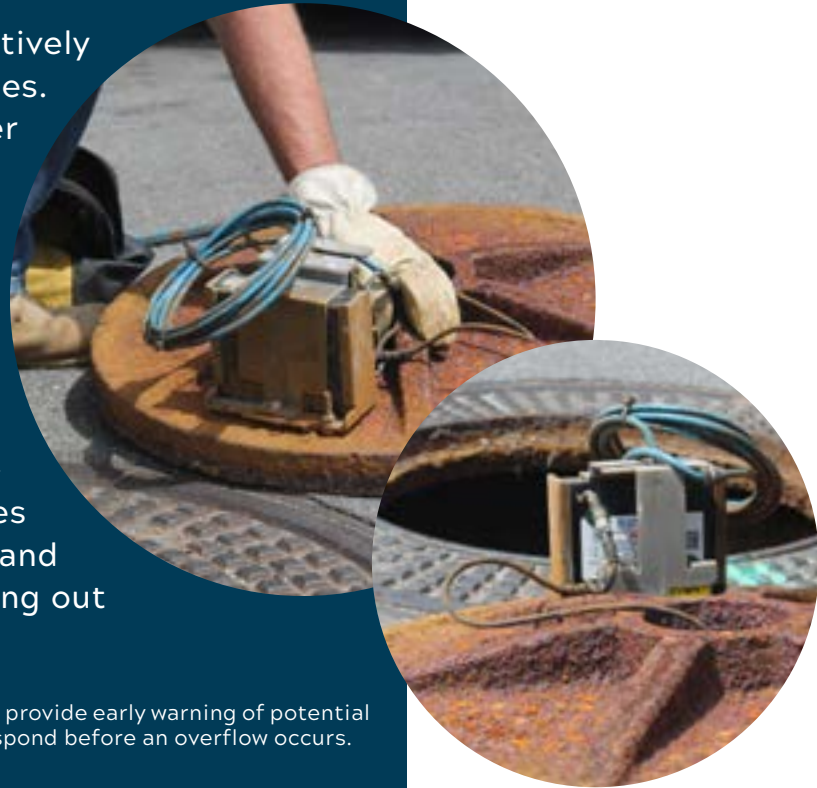
Sensors like this can provide early warning of potential problems, allowing utility maintenance crews time to respond before an overflow occurs.

Risk management is critical in proactively determining and mitigating issues. Mitigating risks in a planned manner is less expensive than reacting to a major system failure. Predictive risk management using state-of-the-art asset management systems, such as pipe, pump, and process sensors, can help a utility spot a problem and plan accordingly before it becomes a catastrophe. Instead of wait-and-react utility management, Digital Utilities proactively plan capital, operational and maintenance activities while smoothing out rate impacts to customers.