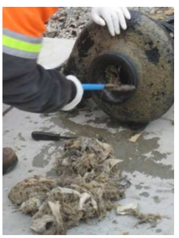
City of Bakersfield, CA