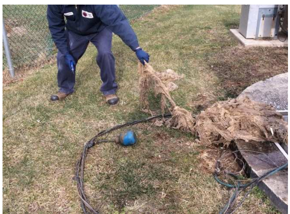
Frederick County, MD

efficiency, increasing the electrical power used by pumps, and potentially even causing pumps to malfunction and stop working completely. Workers must then perform the costly, time consuming, and hazardous task of physically unclogging the pumps. New York City alone spent more than $18 million on wipe-related equipment problems between 2010 and 2015.<sup>3</sup> Every manhour and dollar spent on removing wipe-related clogs is time and money that can no longer be devoted to other crucial projects, such as improving wastewater infrastructure. The following photos of workers removing wipe-related clogs during normal cleanings illustrate the clogs' impact on wastewater systems: