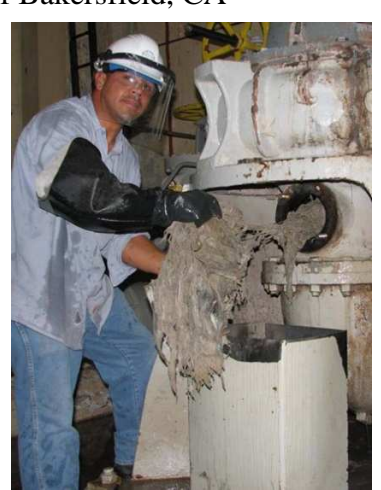
Orange County, CA