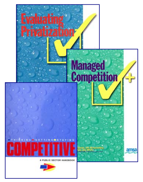
Past NACWA publications highlight industry focus on cost efficiency

Wet weather-related requirements represent a substantial share of these investment needs. Through 2002, more than $6 billion has been spent for CSO-related improvements in 48 communities - a fraction of the total number of systems. Between 1988 and 2002, $4 billion has been spent using solely State Revolving Fund loans for SSO related improvements to address infiltration/inflow and rehabilitation/replacement needs. Even so, an additional investment of